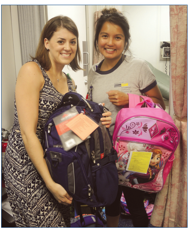
Kids Mobile Medical Clinic/Ronald McDonald Care Mobile Backpack Drive

$2,438 was raised for the Patient Sharing Fund through the Spring and Winter Bake Sales.