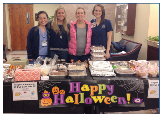
Patient Sharing Fund Bake Sales

$2,438 was raised for the Patient Sharing Fund through the Spring and Winter Bake Sales.