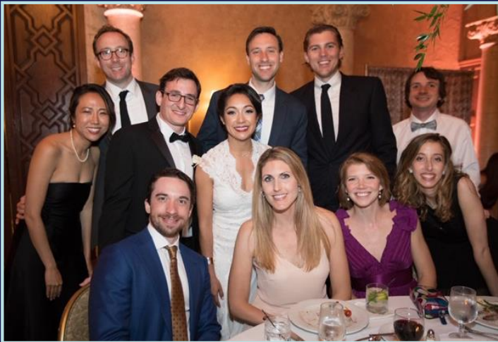
Me with co-residents and significant others

“This residency program is incredible! There is nothing you won’t see during your time here. I left residency feeling extremely competent both surgically and clinically. You will also make life-long friends during your residency. We worked hard but had fun doing it!”